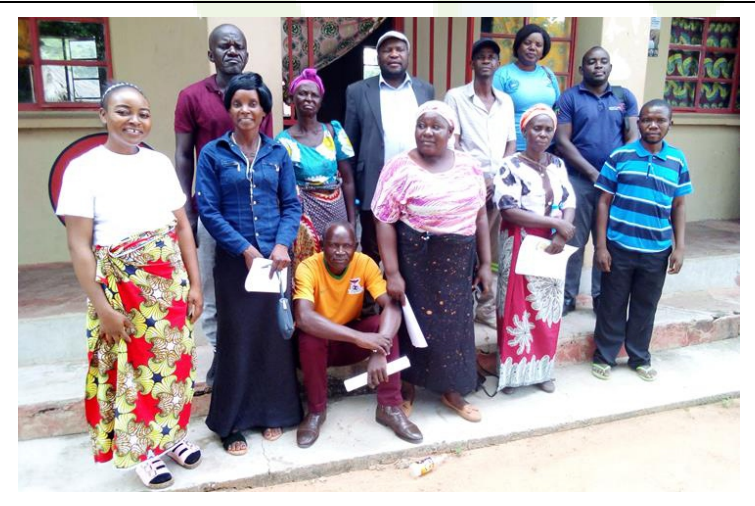
Support for Action meeting

The GMA has observed that the areas not fenced have high HWC the animals are free to envade their fields hence they need to lobbying with other key stakeholders to enable the fence their fields.