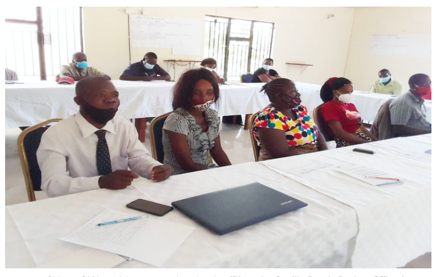
Chiawa GMA participants at action planning

Game management areas (GMAs) are protected areas in communally owned lands that make up more than 70% of the total protected area in Zambia. Overall governance of GMAs has been in decline, reflected in an increased rate of habitat loss, land disputes and declining wildlife populations. This has serious consequences for conservation in Zambia. The project will address tackle key governance challenges at GMAs including issues related to benefit sharing, accountability, rights recognition, participation in decision-making, gender equality, transparency and information sharing, and law enforcement.