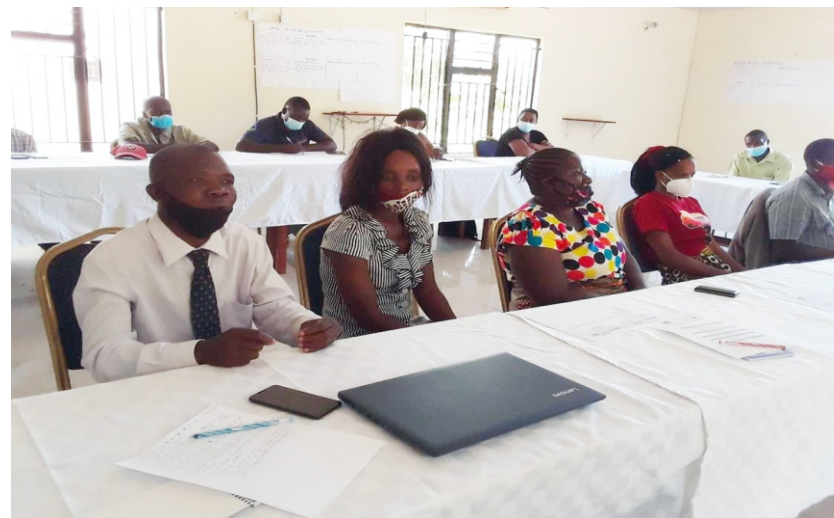
Chiawa GMA participants at action planning

Game management areas (GMAs) are protected areas in communally owned lands that make up more than 70% of the total protected area in Zambia. Overall governance of GMAs has been in decline, reflected in an increased rate of habitat loss, land disputes and declining wildlife populations. This has serious consequences for conservation in Zambia. The project will address tackle key governance challenges at GMAs including issues related to benefit sharing, accountability, rights recognition, participation in decision-making, gender equality, transparency and information sharing, and law enforcement.