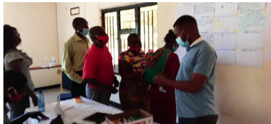
Participants going to stick colors papers to represent their views