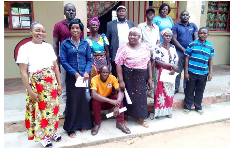
Support for Action meeting